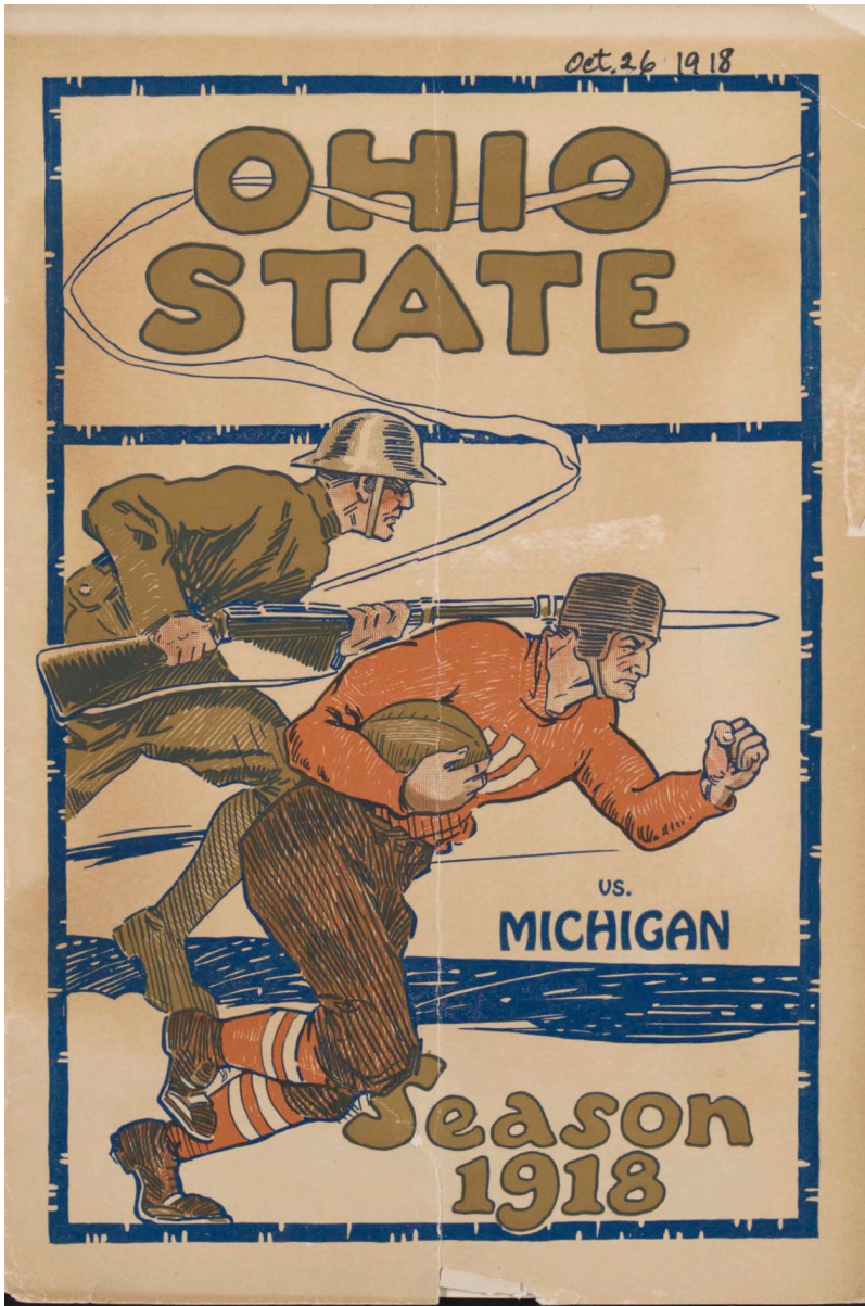
Football program from the Ohio State/Michigan game in 1918.

Station Great Lakes in North Chicago boasted three players later enshrined in the Pro Football Hall of Fame: George Halas, Jimmy Conzelman and John “Paddy” Driscoll.