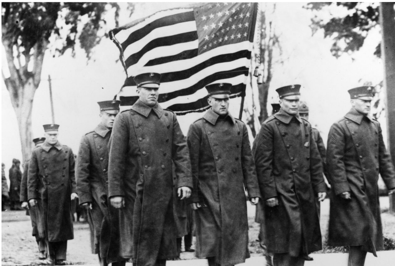
The Mare Island Marines, pictured, beat the Camp Lewis Army in the 1918 Rose Bowl.

Some teams, like Alabama and LSU, were so depleted by the war effort that they’d already canceled their seasons. Others scrambled to remake their schedules, some booking games days or hours before kickoff.