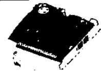
Everex 1200B Modem

Internal; Hayes Compatible 300/1200 baud BITING SOFTWARE HALF SIZEABLE POWER $109